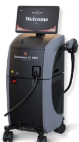
Harmony XL Pro