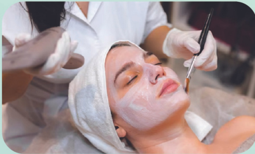
Then - Normal Facials