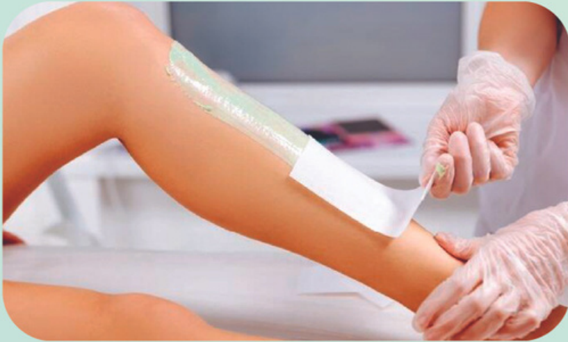
Then - Razor & Wax