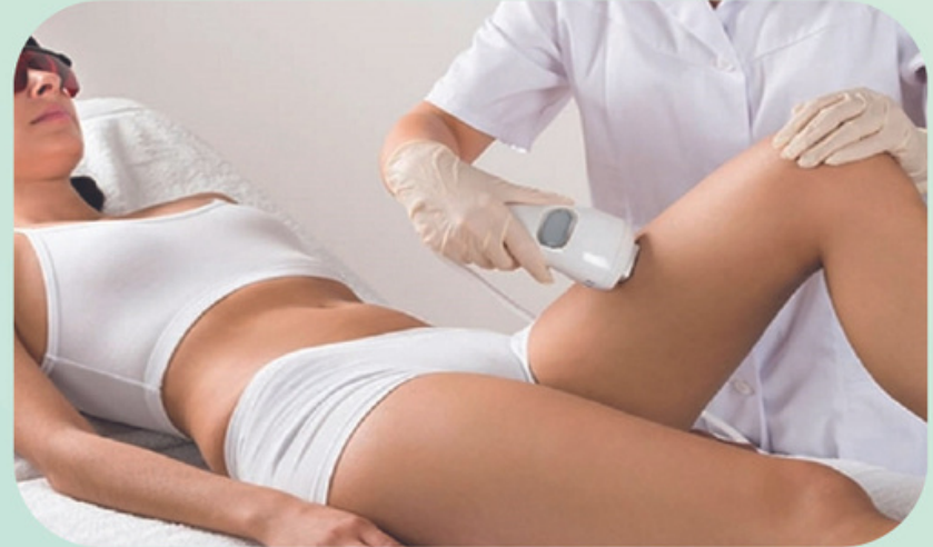
Now - Laser Hair Reduction