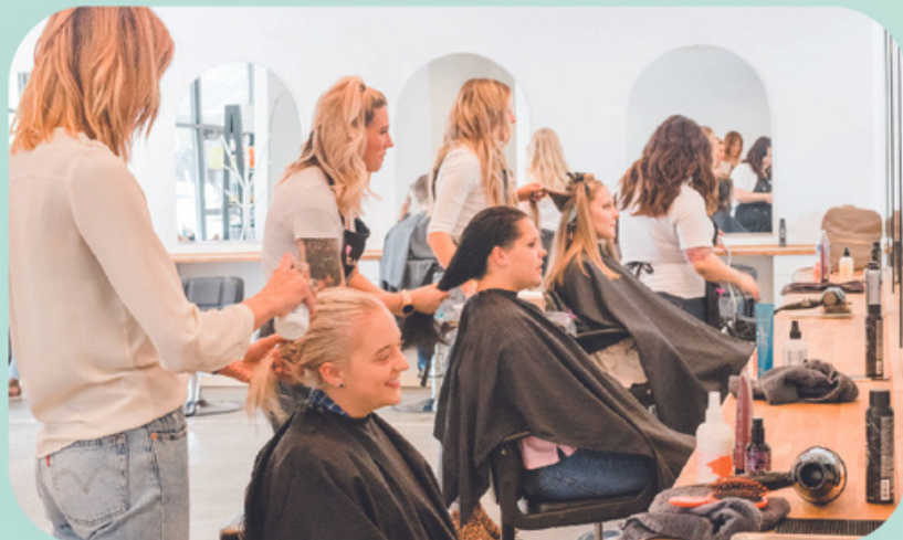
No Personalised Solutions